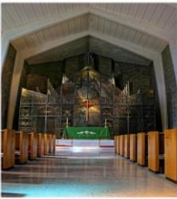
SAINT PAUL’S EPISCOPAL CHURCH ALBANY, NEW YORK

February 18 12:10 p.m. in All Saints’ Chapel 7:00 p.m. in Saint Paul’s Episcopal Church